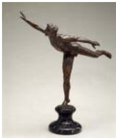
Flying Sphere , 1920 Robert Tait-MacKenzie Bronze 56 high x 50 wide x 16 cm deep Power Corporation of Canada Collection

Original ROM exhibition celebrates the passion of Canada's collectors