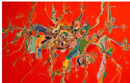
Lubicon , 1988, Alex Janvier Acrylic on canvas, 165.2 x 267 cm. The Edmonton Art Gallery Collection, purchased with funds from the Estate of Jean Victoria Sinclair.