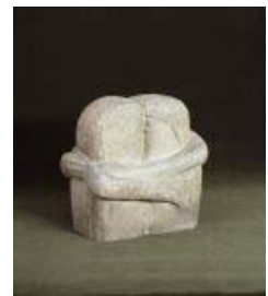
The Kiss. 1908-1919 Constantin Brancusi Plaster with oil staining patina 26 wide x 28 high x 20 cm deep On loan from The Latner Art Collection

(Toronto, Ontario – September 17, 2007) The Royal Ontario Museum (ROM) is pleased to present Canada Collects: Treasures from Across the Nation , an integral component of the Museum's Fall 2007 Season of Canada . This original ROM exhibition is on display in the ROM's Garfield Weston Exhibition Hall on Level B2 in the Michael Lee-Chin Crystal from Saturday, October 6, 2007 until Sunday, January 6, 2008 .