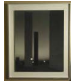
Photograph, Satellite Towers – Luis Barragan. 2000-01, 183 x 152 cm Hiroshi Sugimoto Black and white On loan from Mr. Alan Schwartz

The exhibition's final objects originate in the 21 st century. These include a Hiroshi Sugimoto black and white photograph of Mexican architect Luis Barragan's buildings, Satellite Towers , considered to be among the world's greatest sculptural monuments. On loan from a private collection, the photograph dating to 2000–2001 is part of Sugimoto's architectural series and is the last object encountered by visitors in the exhibition.