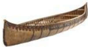
Pierre Trudeau’s Canoe Circa 1968, Birchbark 76 cm wide x 5 m long. On loan from the Canadian Canoe Museum, courtesy of the Pierre Elliott Trudeau Estate.

Assembling some of the most iconic historical Canadian artifacts in the country, Canada Collects is certain to strike a patriotic chord among many visitors. From an early 1709 Hudson’s Bay Company map of the Hudson’s Bay and Straits, to the 1982 Proclamation of the Canadian Constitution Act, the exhibit touches on many aspects of the country’s political and social history. Other notable Canadian items include Lucy Maud Montgomery’s